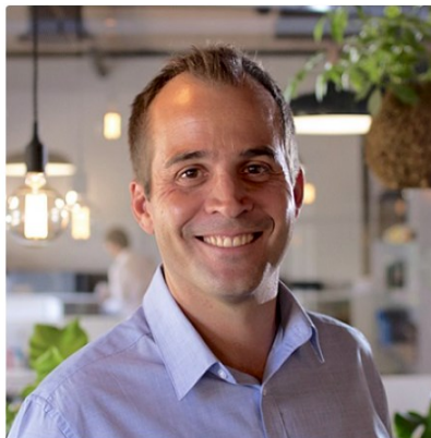
Prof De Wet Swanepoel, South Africa